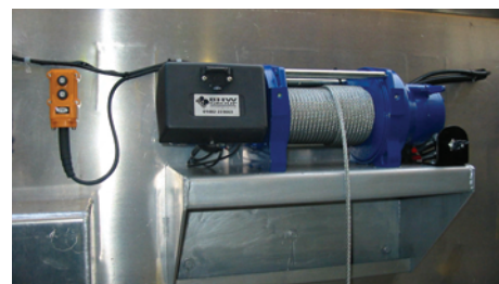
Fallen stock winch in position - (without roller guides or mounting plate)

WINCHMASTER Unit 6 South Orbital Trading Park Hedon Road Hull HU9 1NJ T: +44 (0)1482 223663 F: +44 (0)1482 218285